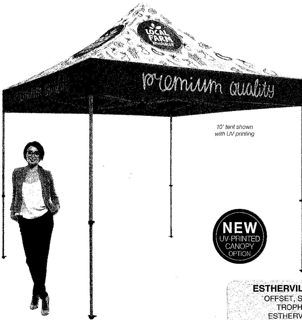
10' tent shown with UV printing