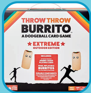
I. Throw Throw Burrito EXTREME

Just complete an activity and write your preferred prize drawing letter in the entry blank!