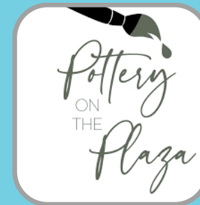
M. $50 Pottery on the Plaza Gift Card