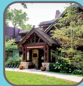
L. $50 MacNider Art Museum Card