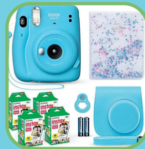
K. Instax Bundle