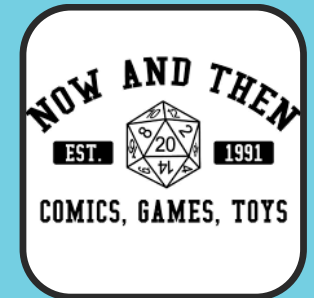
N. $50 Now and Then Gift Card