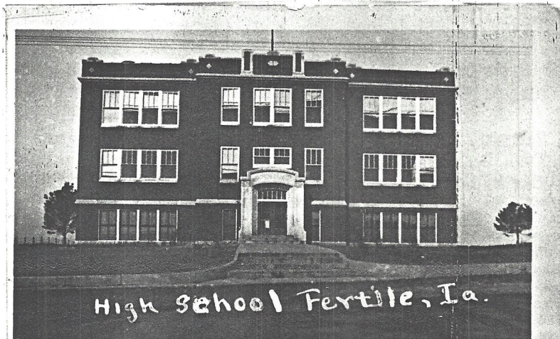
The way we were before 1939