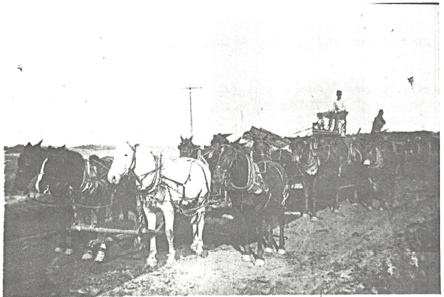
A dirt elevating machine in this picture is used to load dirt into the wagons as the crew works on No. 9.