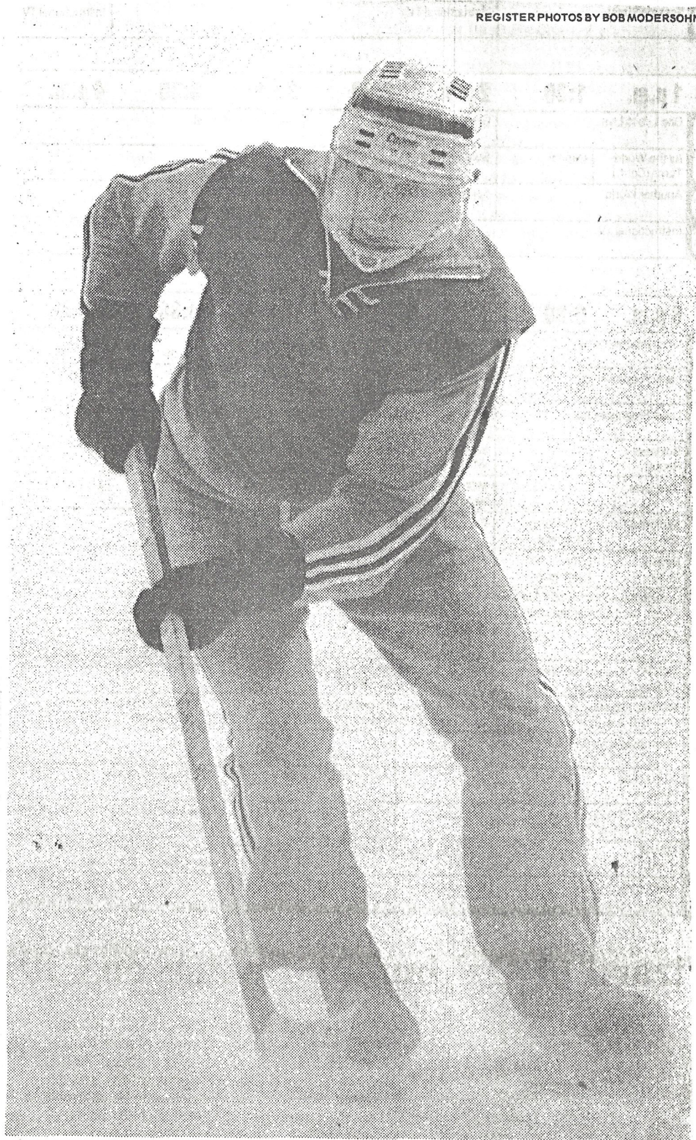
The 65-year-old skater from Fertile wields a manly stick from his left wing position.