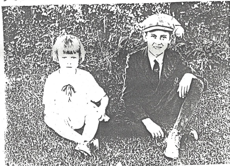
Children of Wall