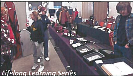
Lifelong Learning Series